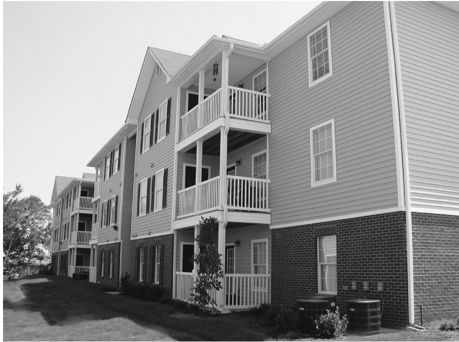
Cordova Campus Student Housing